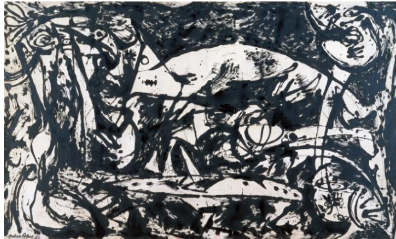
Number 14 1951

Jackson Pollock dripped and splashed paint onto his canvases. Van Gogh used varied marks. Yayoi Kusama creates paintings, sculptures and installations entirely made up of endless dots.